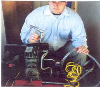
A SMALL COMPRESSOR AND THE QUIK GUN DOES THE JOB @ 80 PSI**

QUIK GUN w/Pick-up Hose. Sugg. Retail $65.00 plus $5.25 S/H