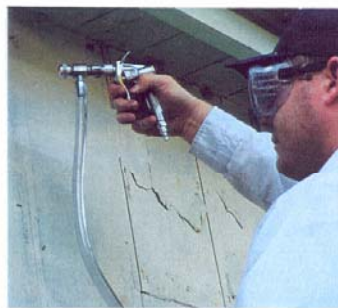
HOLDING GUN CLOSER TO THE SURFACE WILL PRODUCE A SMALLER PATTERN *