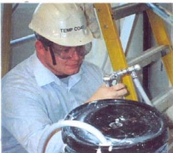
KEEP THE GUN WITHIN 4" OF THE TEMP-COAT BUCKET TO ASSURE PROPER PRODUCT APPLICATION.