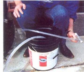
LOAD THE HOSE HOLDING THE QUIK GUN AT BUCKET LEVEL