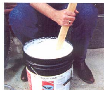
KEEP TEMP-COAT MIXED AS YOU SPRAY BY STIRRING WITH A FLAT STICK OR PADDLE