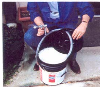
IF YOU MUST STOP SPRAYING EMPTY THE GUN AND HOSE AS INSTRUCTED AND WASH THE GUN THOROUGHLY WITH FRESH WATER.