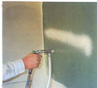
HOLDING THE QUIK GUN 14" FROM THE SURFACE TO BE COATED WILL PRODUCE A 4" TO 5" PATTERN