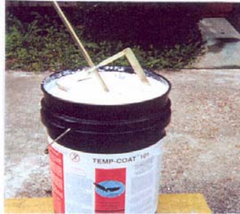
MIX THE PRODUCT FOLLOWING THE SIMPLE INSTRUCTIONS